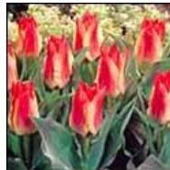
Figure 5. Plaisir

Order your bulbs early enough that they can spend anywhere from 8 to 10 weeks basking in the chill of your frig. Store them in a mesh bag so that they get good air circulation. If you are a fruit lover you may want to strongly consider getting a spare refrigerator – one of the minis so readily available. Fruit gives off ethylene gas – and ethylene gas will kill the flower inside your bulbs.