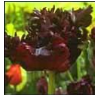
Figure 3. Black Parrot