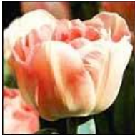
Figure 1. Angelique

Tulips are classified with perennials but often need to be treated as annuals. Dig up your tulip bulbs once the foliage has died & store them in a cool dry area for replanting in the fall. There are a wide variety of tulips, some are shown in the following figures.