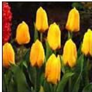
Figure 4. Candela