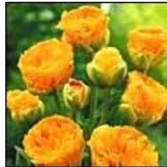
Figure 2. Beauty of Apeldoorn